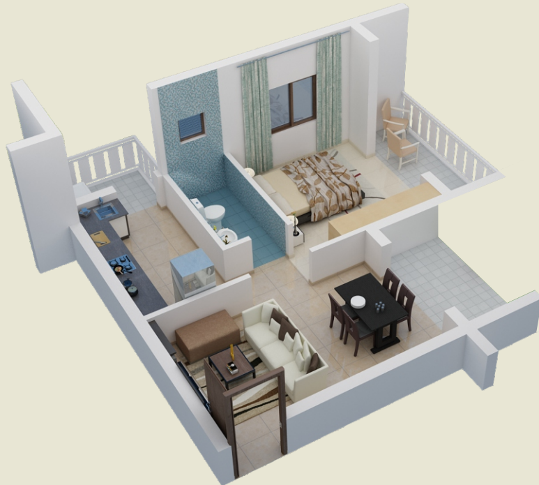
1 BHK - 67 SQ.MTR / 721.18 SQ.FT. Apartment Without Terrace