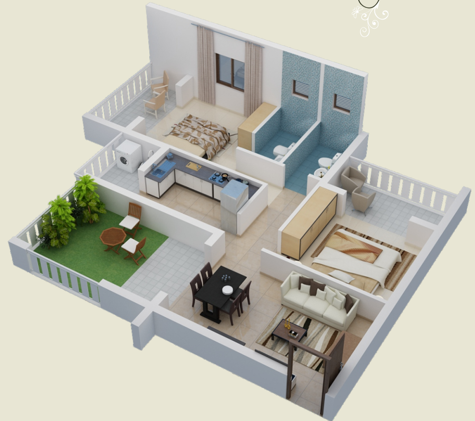
2 BHK - 111 SQ.MTR / 1195 SQ.FT. Apartment With Terrace