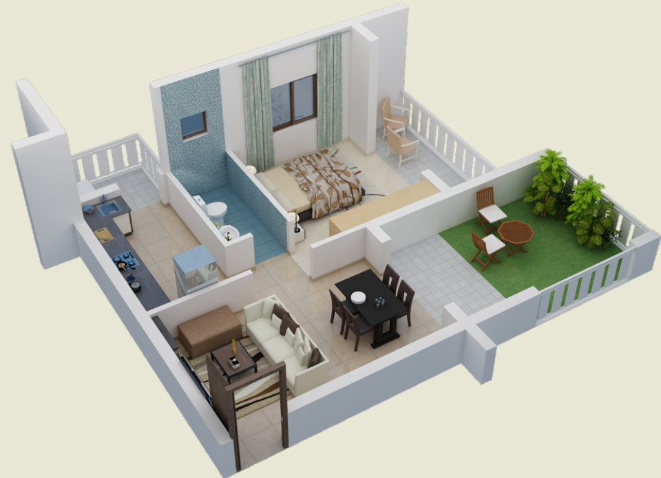
1 BHK - 76 SQ.MTR / 818.06 SQ.FT. Apartment With Terrace