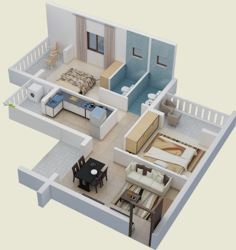
2 BHK - 102 SQ.MTR / 1098 SQ.FT. Apartment Without Terrace