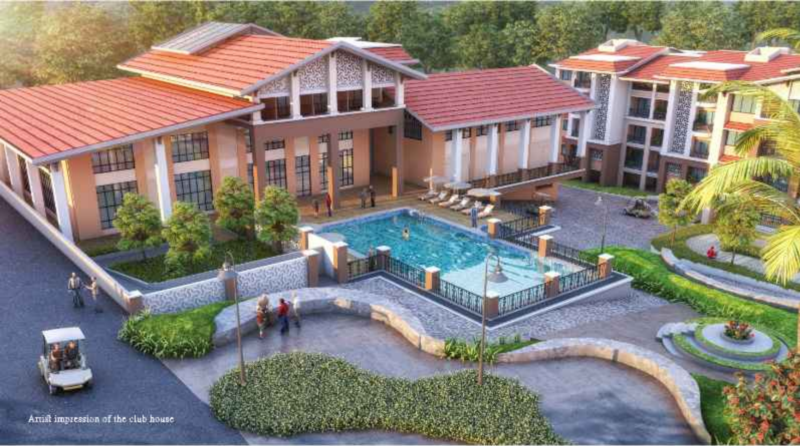
Aerial impression of the club house