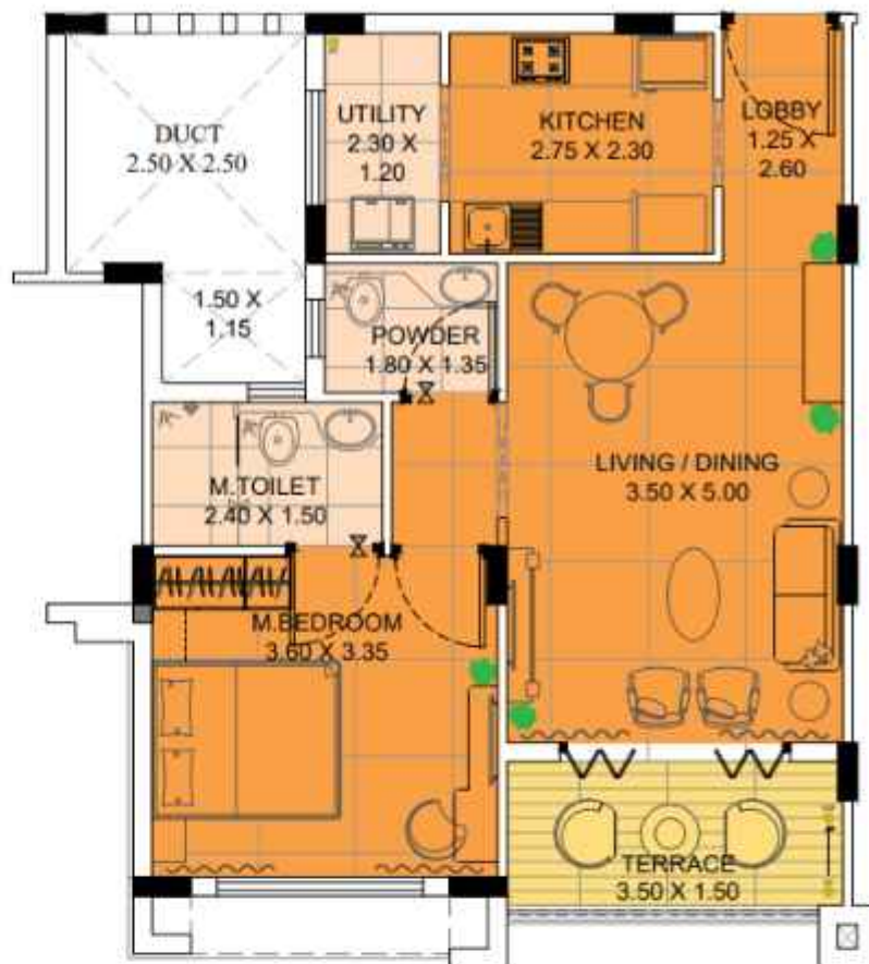
Furniture Layout 1 BHK Flat