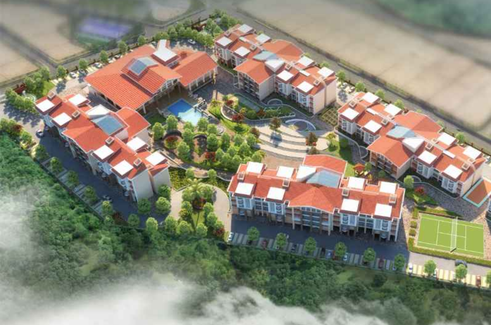
Artist impression of a birds eye view of the project