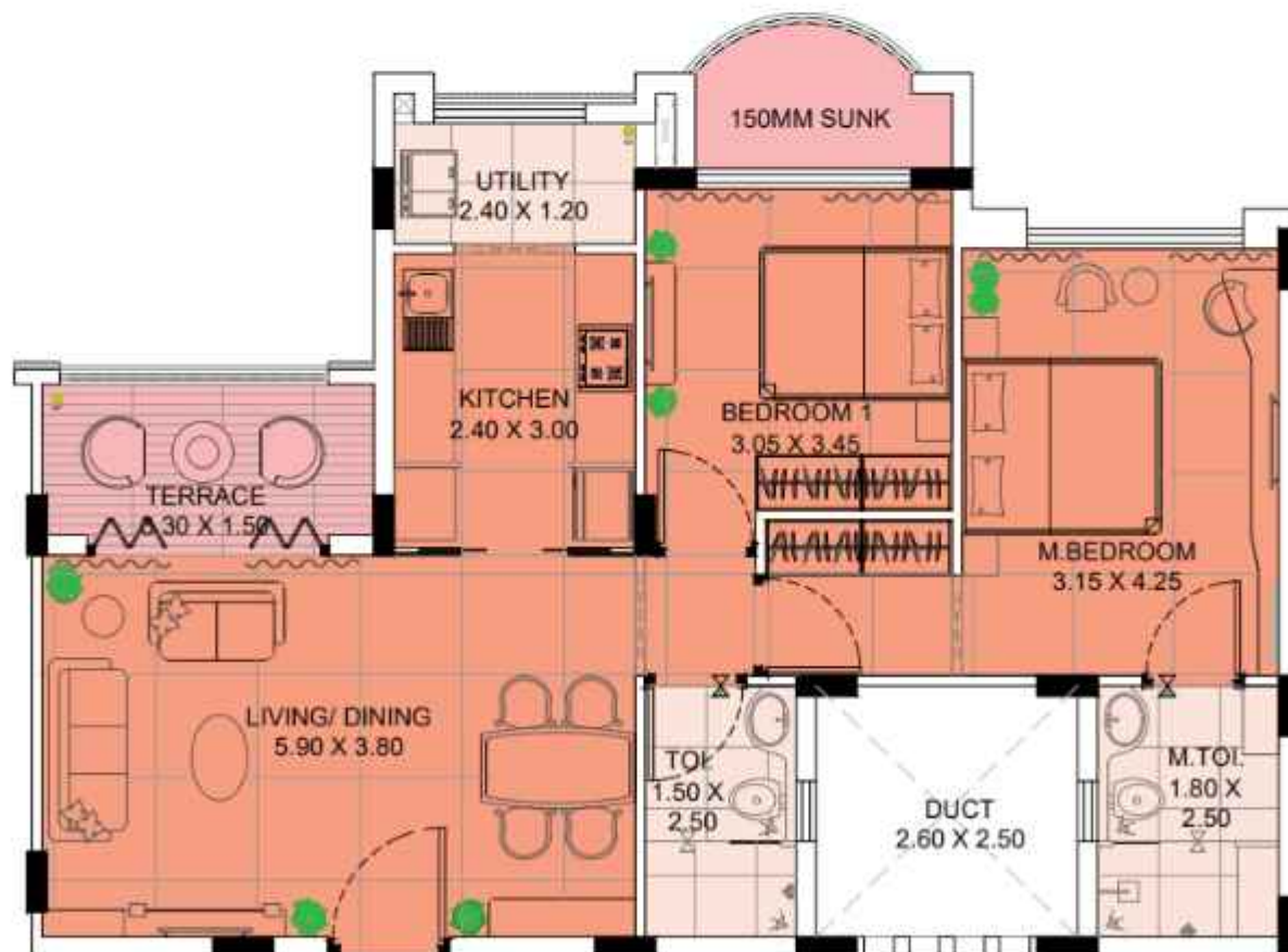
Furniture Layout 2 BHK Flat