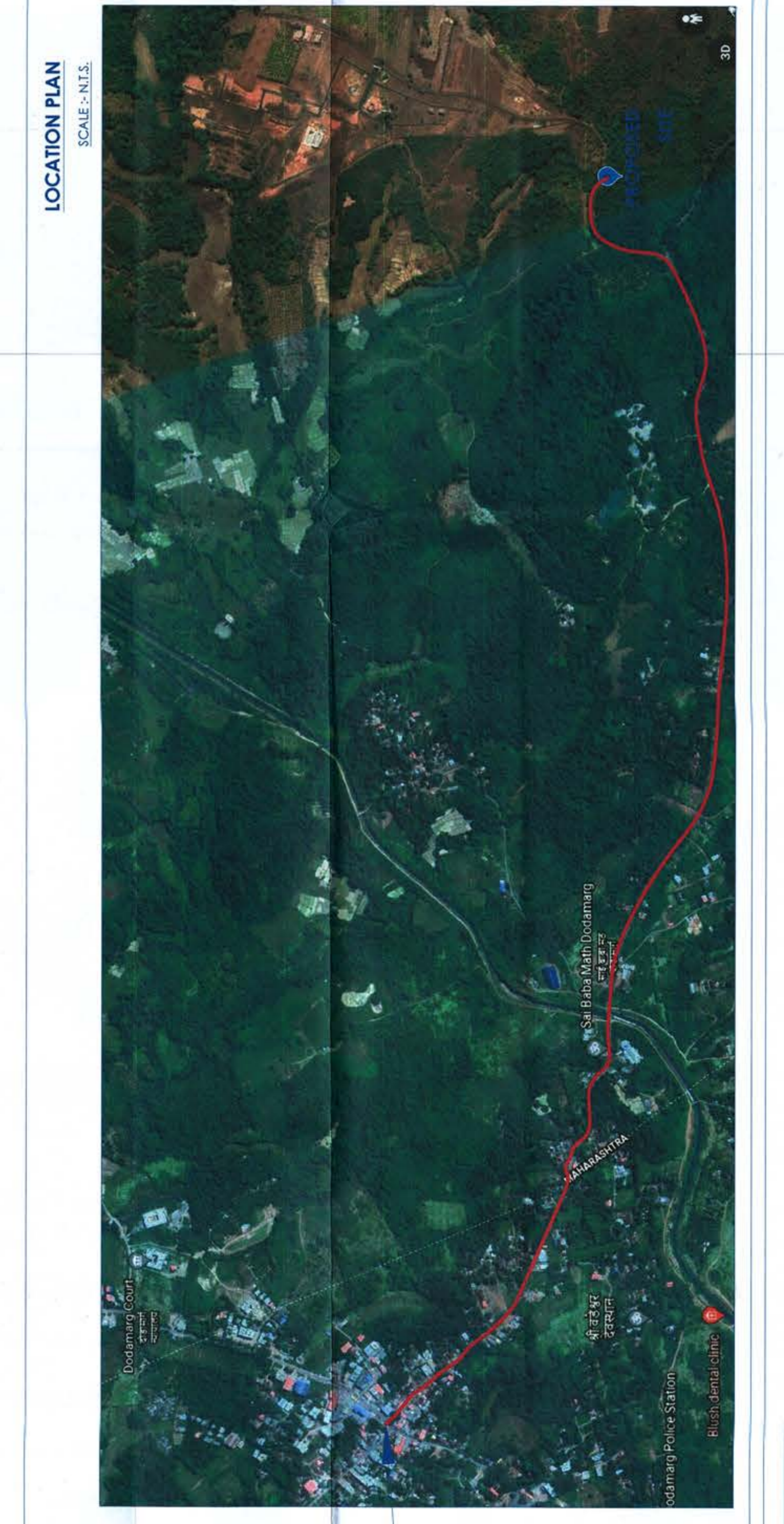
LOCATION PLAN SCALE: 1:500